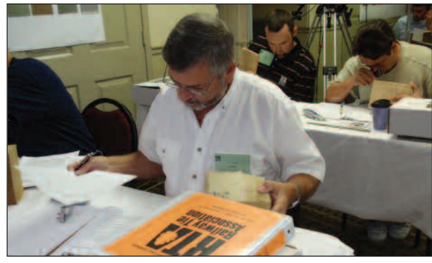
Finally, students are tested on their species ID skills before heading back to the plant to do a tour and then a final exam.