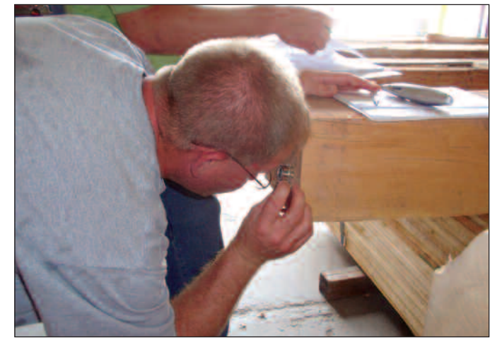
...then it's back to the final exam where everyone is tested and course grades are posted.