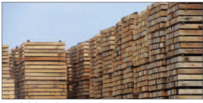
...an air drying yard...