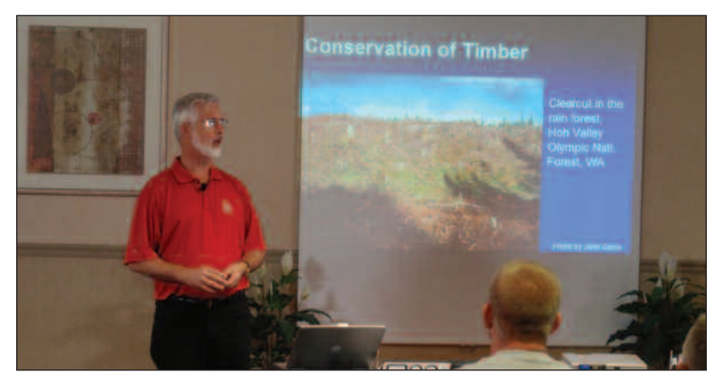
Other topics include forest management practices and wood preservation.