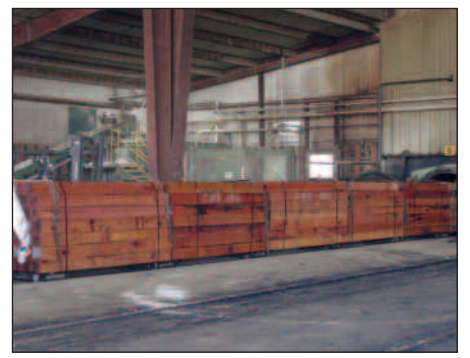
...and wood preservation, including borate pre-treatments, before creosote treament...