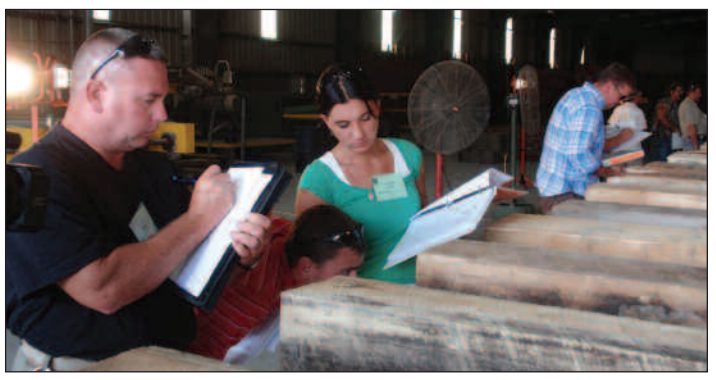
Then, it's off to Seaman Timber Company's plant in Montevallo to work with full-sized ties. Graders not only must identify species, but also must make sure they get the grade right.